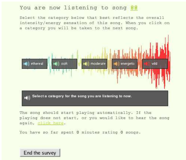
Figure 1. Screenshot of RateIt!, our Internet-based listening test.

Soft Having or showing a kindly or tender nature. Synonyms: gentle, soothing, calm/peaceful .